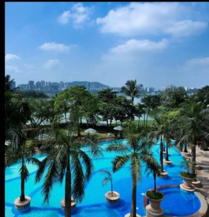
THE RENAISSANCE MUMBAI CONVENTION CENTRE